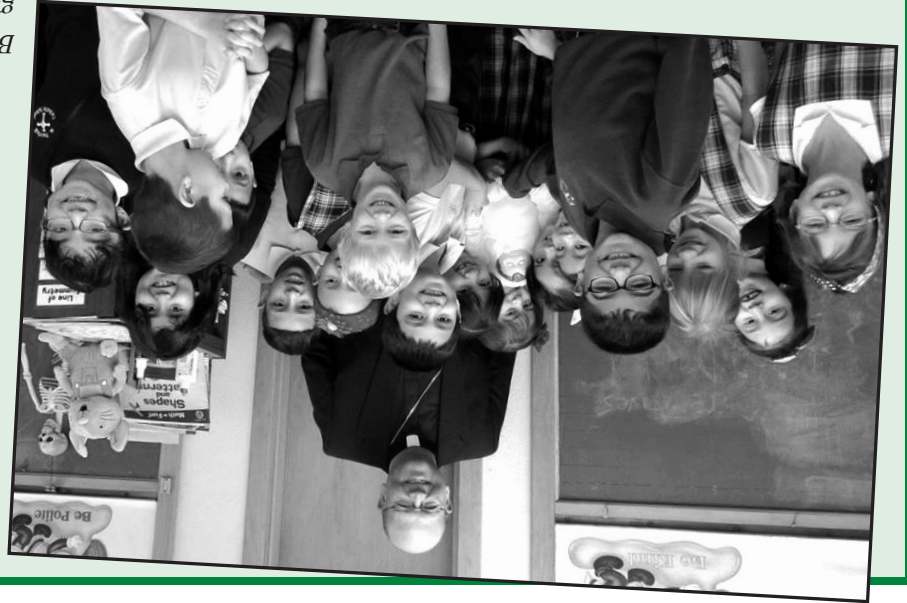
graders last year.

2023 N. Arkansas • Wichita, Kansas 67203 PHONE: 316-262-4071 EMAIL: school@stpatswichita.org