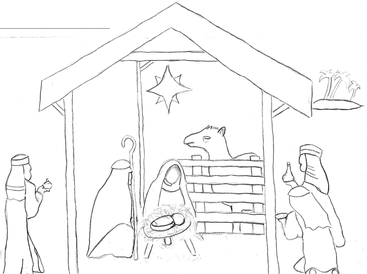
Drawing by Mateo O., Grade 8